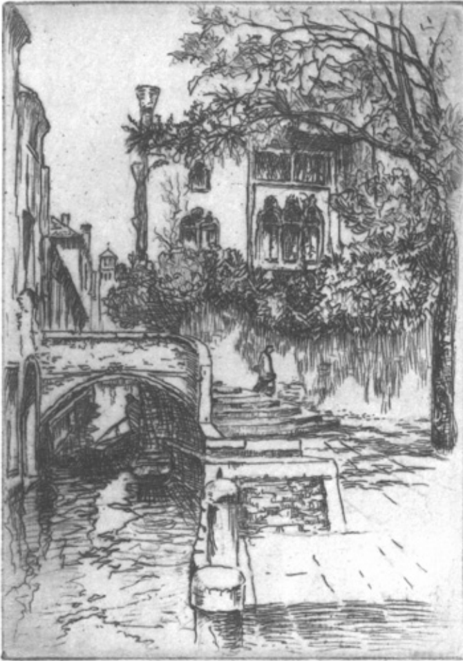
San Cristoforo , 1928, drypoint, 4 15 / 16 x 3 7 / 16 in.