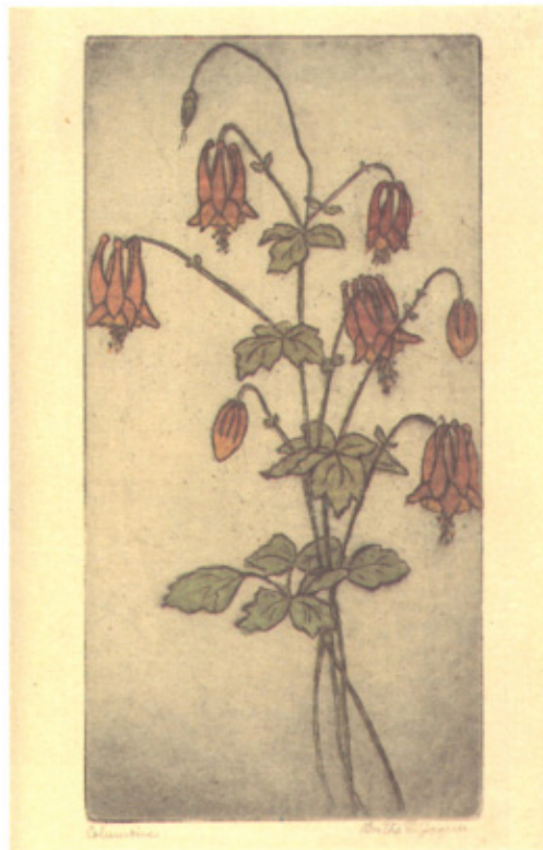
Columbine , 1931, drypoint with watercolor, 9 5 / 16 x 4 11 / 16