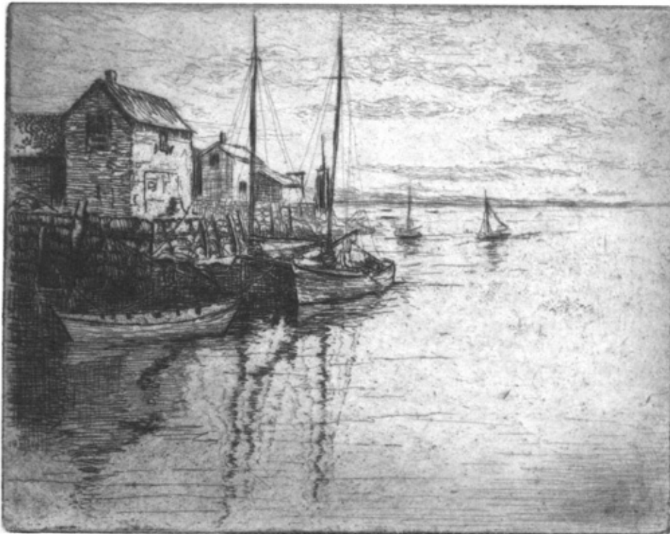
Salt Schooners , 1910, drypoint, 3 15 / 16 x 4 15 / 16 in.