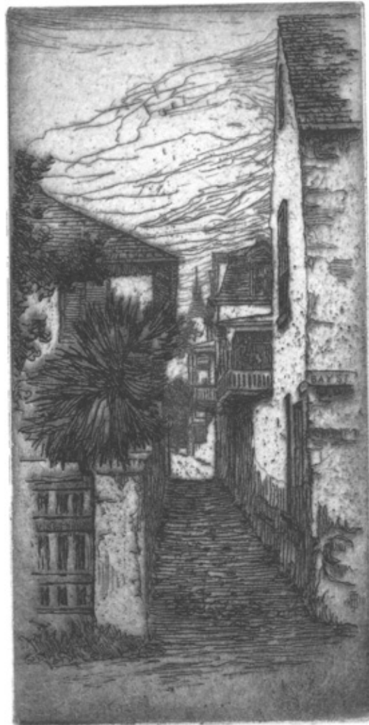
Treasury Street — St. Augustine, 1910, drypoint, 6 7 / 8 x 3 3 / 16 in.