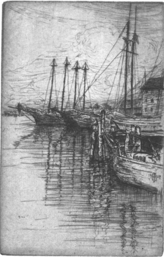
Fishing Boats at Gloucester, 1907, drypoint, 5 7/8 x 3 7/16 in.