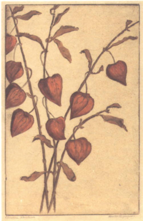
Chinese Lantern , 1923, drypoint with watercolor, 9 5 / 16 x 5 15 / 16

CATALOGUE RAISONNÉ OF THE PUBLISHED PRINTS*