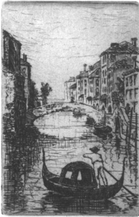
Venice, 1898, drypoint, 3 15 / 16 x 2 5 / 16 in.