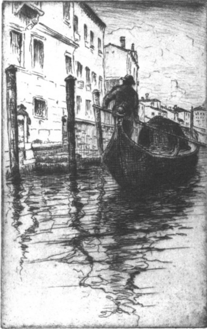
Giovanni , 1916, drypoint, 5 7 / 16 x 3 7 / 16 in.