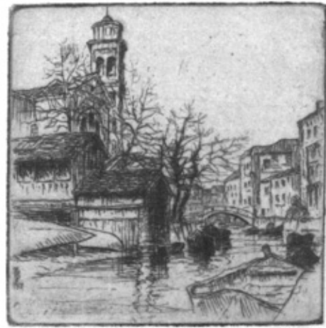
Trivoglio Square , 1917, drypoint, 2 15 / 16 x 2 15 / 16 in.