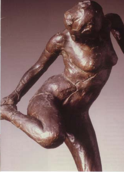
Above: Dancer Looking at the Sole of her Right Foot (ca. 1895-1910). Bronze.