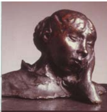
Left: Head Resting on One Hand (ca. 1879-81). Bronze.