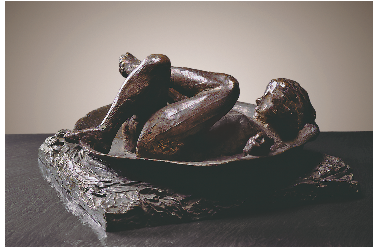
EDGAR DEGAS, The Tub, conceived around 1881-1889, bronze cast in 1920's and after from a wax sculpture. Collections of MASP, Museu de Arte de São Paulo, Assis Chateaubriand, São Paulo, Brasil.

On Exhibition January 25 Through April 27, 2008