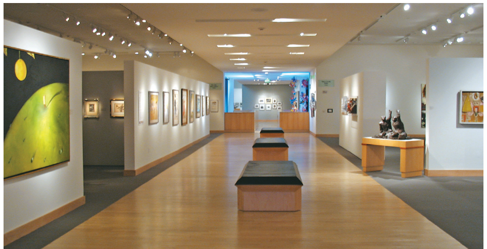
Visit the Museum's second-floor Permanent Collection galleries to explore connections between works of art in Degas In Bronze and works of art by Degas's contemporaries.

The Museum is delighted to arrange reserved tours for groups. Reservations must be made in advance by calling Visitor Services at 561.392.2500, ext. 103 . For school tours, call 561.392.2500, ext. 106 .