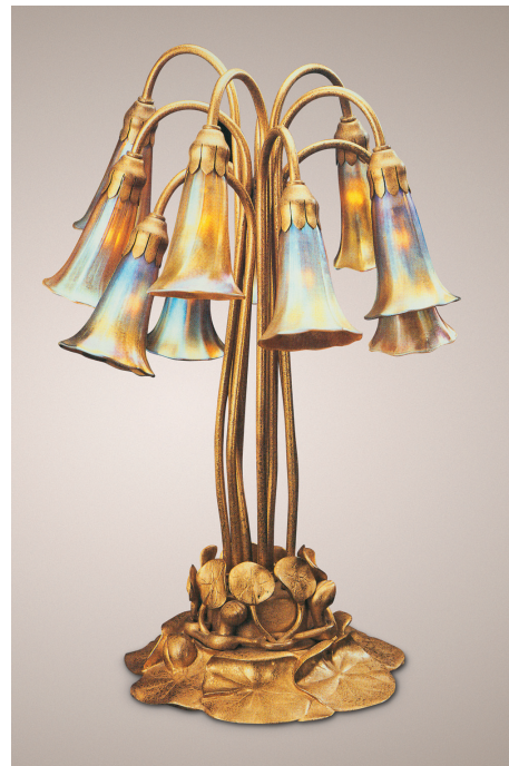
TIFFANY STUDIOS (1902-1938), Ten Light Lily lamp , circa 1898-1930, favrile glass and bronze, height 20 inches

No American designer was more closely linked with Art Nouveau than Louis Comfort Tiffany (1848-1933), whose luminous glass designs wedded technical innovations and superb craftsmanship with the highest artistry, infusing everyday objects with beauty derived from nature. Louis Comfort Tiffany, son of Tiffany and Company co-founder Charles L. Tiffany, formed the Tiffany Glass Company in 1885. Throughout a 40-year career, he forged a unique style that combined superb craftsmanship with a love of natural forms and brilliant color.