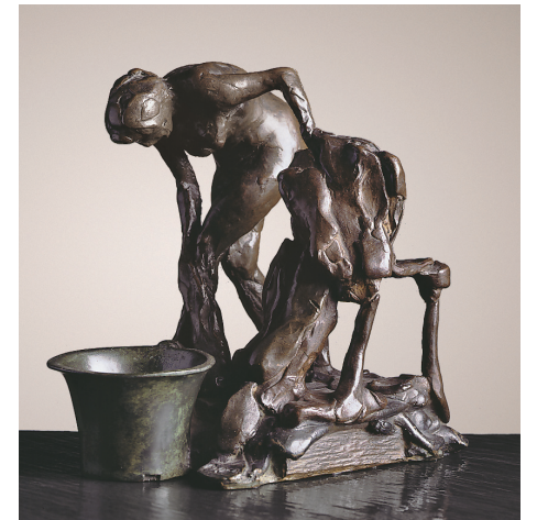
EDGAR DEGAS, Woman Washing Her Left Leg, conceived around 1890-1911, bronze cast in 1919-1937 or later from a yellow, red, and olive green wax and ceramic sculpture. Collections of MASP, Museu de Arte de São Paulo, Assis Chateaubriand, São Paulo, Brasil.

Members' Preview Reception FRIDAY, JANUARY 25 FROM 6:00 TO 9:00 PM Light refreshments, wine bar