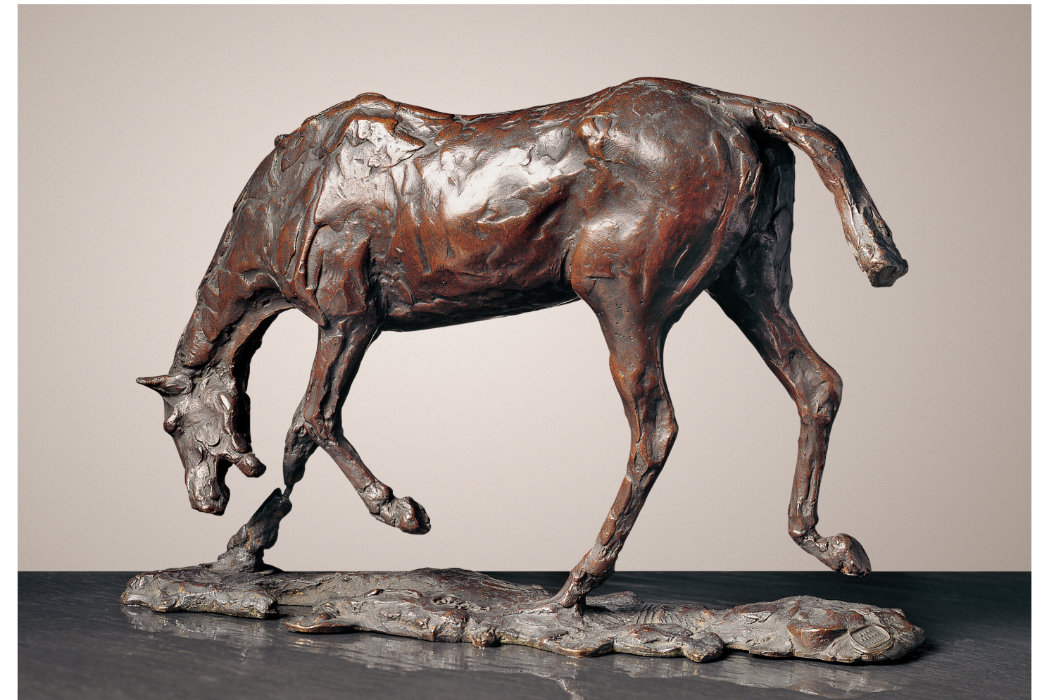
EDGAR DEGAS, Horse at Trough, conceived around 1865-1868, bronze cast in 1920's and after from a wax sculpture. Collections of MASP, Museu de Arte de São Paulo, Assis Chateaubriand, São Paulo, Brasil.