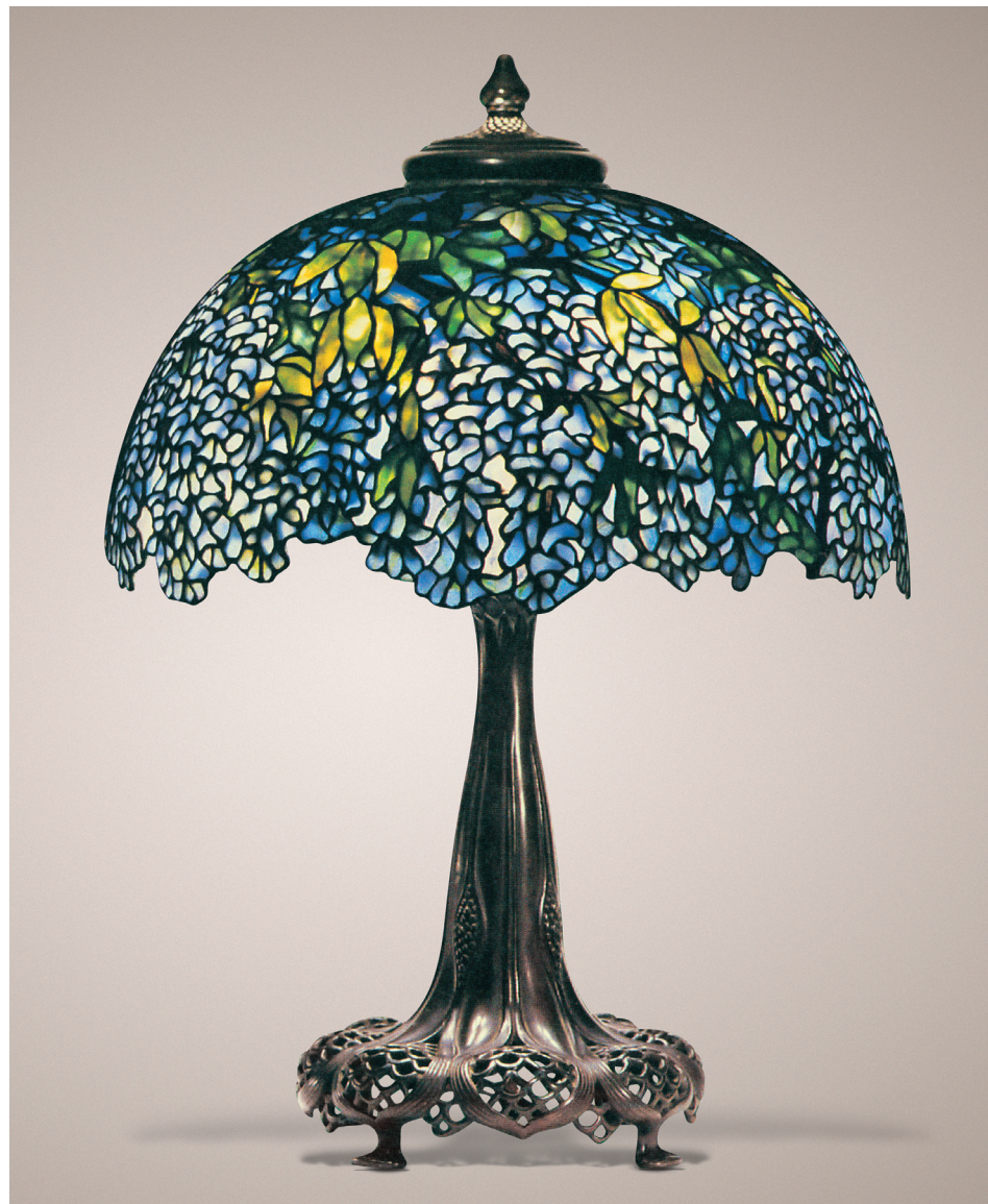
TIFFANY STUDIOS (1902-1938), Wisteria Table Lamp , circa 1899-1920, leaded glass and bronze, shade: 21 5/8 inches diameter, base: 29 inches high. From the exhibition Tiffany Studios: The Holtzman Collection