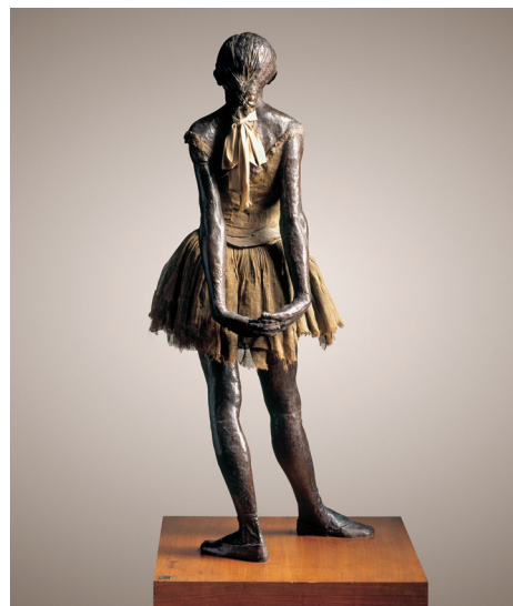
EDGAR DEGAS, Little Dancer, Aged Fourteen, conceived around 1878-1881, bronze cast in 1920s and after from a wax sculpture. Collections of MASP, Museu de Arte de São Paulo, Assis Chateaubriand, São Paulo, Brasil.

exhibition presents the vintage set now owned by the Museu de Arte de São Paulo Assis Chateaubriand, São Paulo, Brasil. Other vintage sets of the 73 works are in the collections of the Metropolitan Museum of Art, New York; the Musée d'Orsay in Paris; and the Ny Carlsberg Glyptotek in Copenhagen. Rarely are all 73 bronzes exhibited together, but when they are, they reveal in their sheer complexity of variations how Degas approached and resolved challenges in his work, and the genius of his solutions.