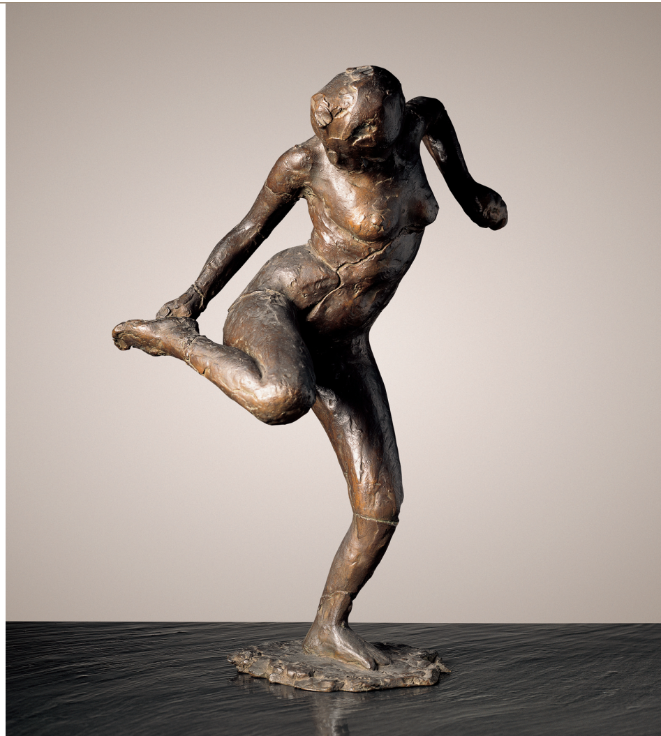
EDGAR DEGAS, Dancer Looking at the Sole of Her Right Foot, conceived around 1882-1895, bronze cast in 1919-1937 or later from a dark green wax and cork sculpture. Collections of MASP, Museu de Arte de São Paulo, Assis Chateaubriand, São Paulo, Brasil.

Degas in Bronze offers a rare opportunity to view these 73 sculptures, cast in bronze from Degas's original composite and wax models.