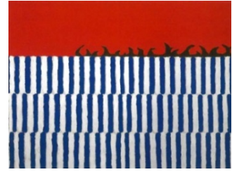
Bess, Forrest (1911-77) Untitled , 1958 Oil on canvas Museum of Fine Arts Houston, Texas, USA Museum purchase funded by Duke Energy

Featuring paintings of Houston-based artists from over the course of several decades, this exhibit showcases the development of modernism in Texas from the 1950s to 1980s. Several artists including Dorothy Hood, John Biggers, Ibsen Espada and Corpus Christi's Trudy Sween are in the Museum's permanent collection.