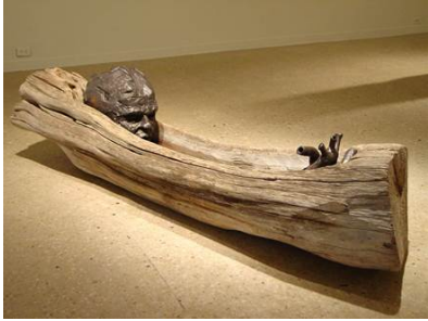
Greg Reuter Seek the Heart , 1990 Ceramic, bronze and wood Collection of AMST