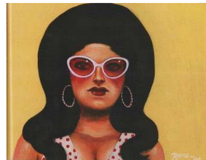
Ricardo Ruiz La Dottie , 2006 Acrylic on Wood

This exhibition features 70 paintings by 29 artists from the renowned Chicano art collection of Cheech Marin, well known for his work in movies, television and improvisational comedy. The collection, featuring paintings that average 16 square inches and smaller, includes a variety of styles such as photo-realism, abstraction, portrait, and landscapes, which offer the viewer a window into the life of the artists.